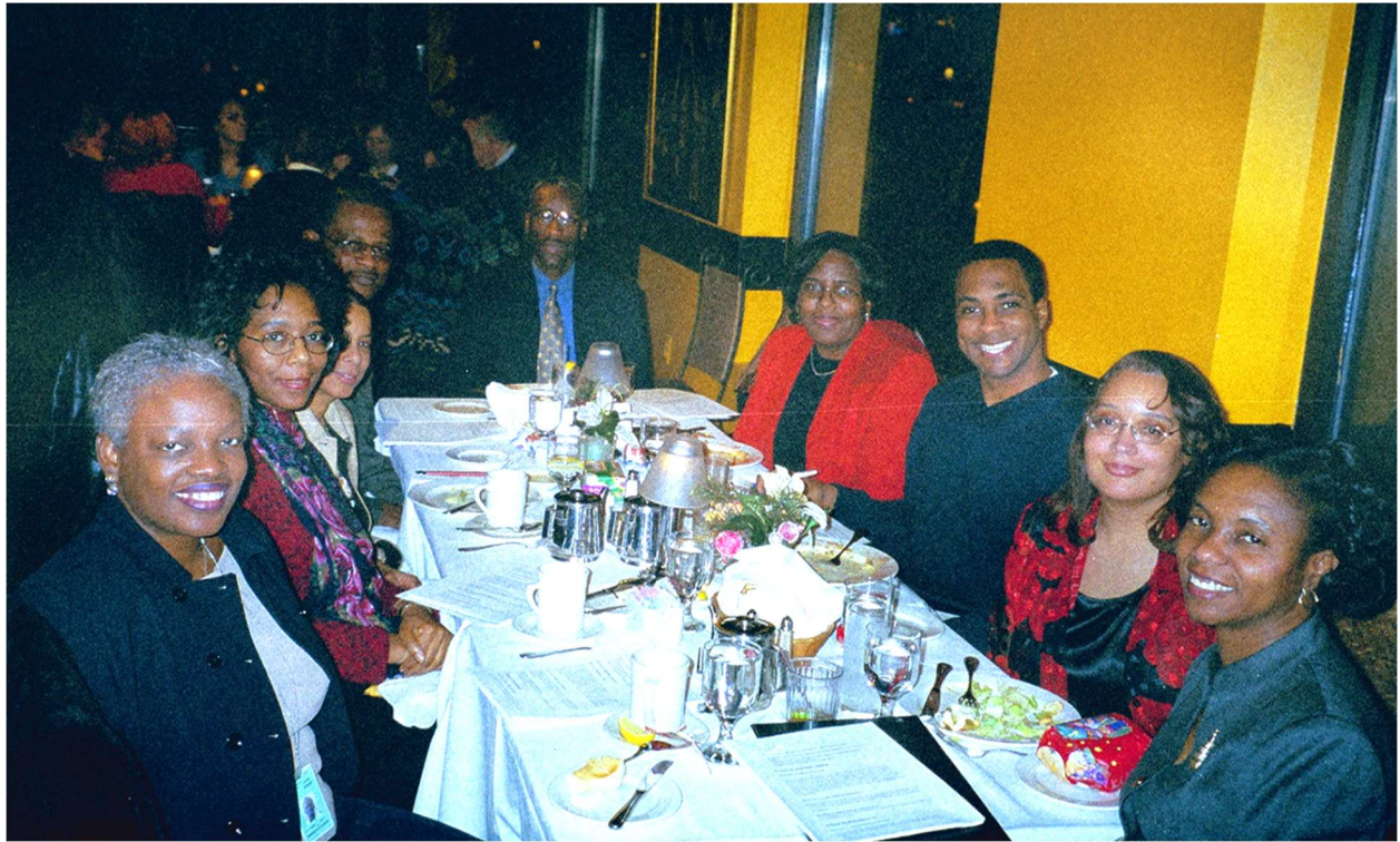
A Working Holiday Party in 2002- From HUEDAA's Archives